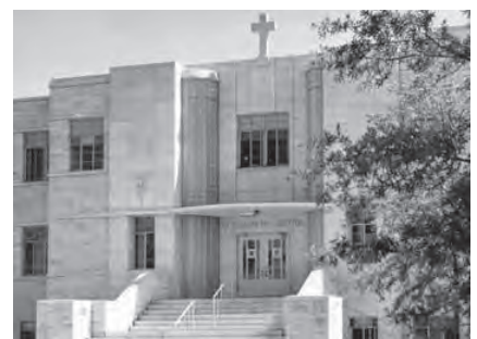
St. Elizabeth's Main Entrance