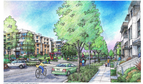
VIEW TOWARD BART STATION