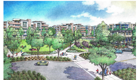
VIEW OF CENTRAL PARK