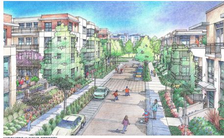
WOONERF "LIVING STREET"